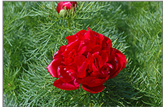
Double Fernleaf Peony flowers